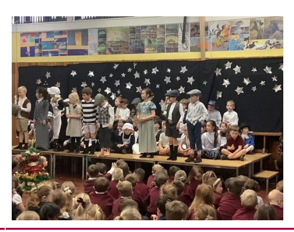
Have a lovely weekend and don't forget to check the calendar for the key events over the final 4 days of term.