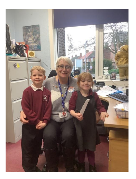
Thankyou for all your hard work and commitment to our school. We hope you enjoy your retirement!