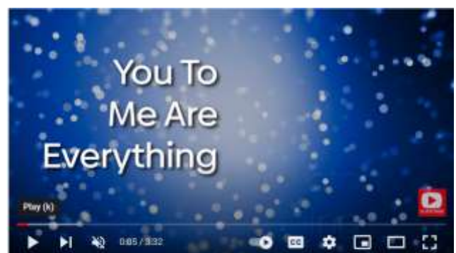
Makaton - YOU TO ME ARE EVERYTHING - Singing Hands

We LOVE 'Singing Hands' at our school. Perhaps you can try this one at home! They are a fabulous way to learn some more Makaton with your child.