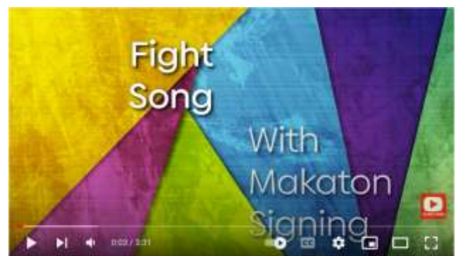
Makaton - FIGHT SONG - Singing Hands