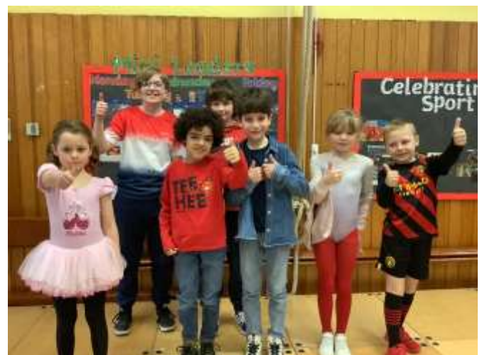
All our fantastic Contestants!